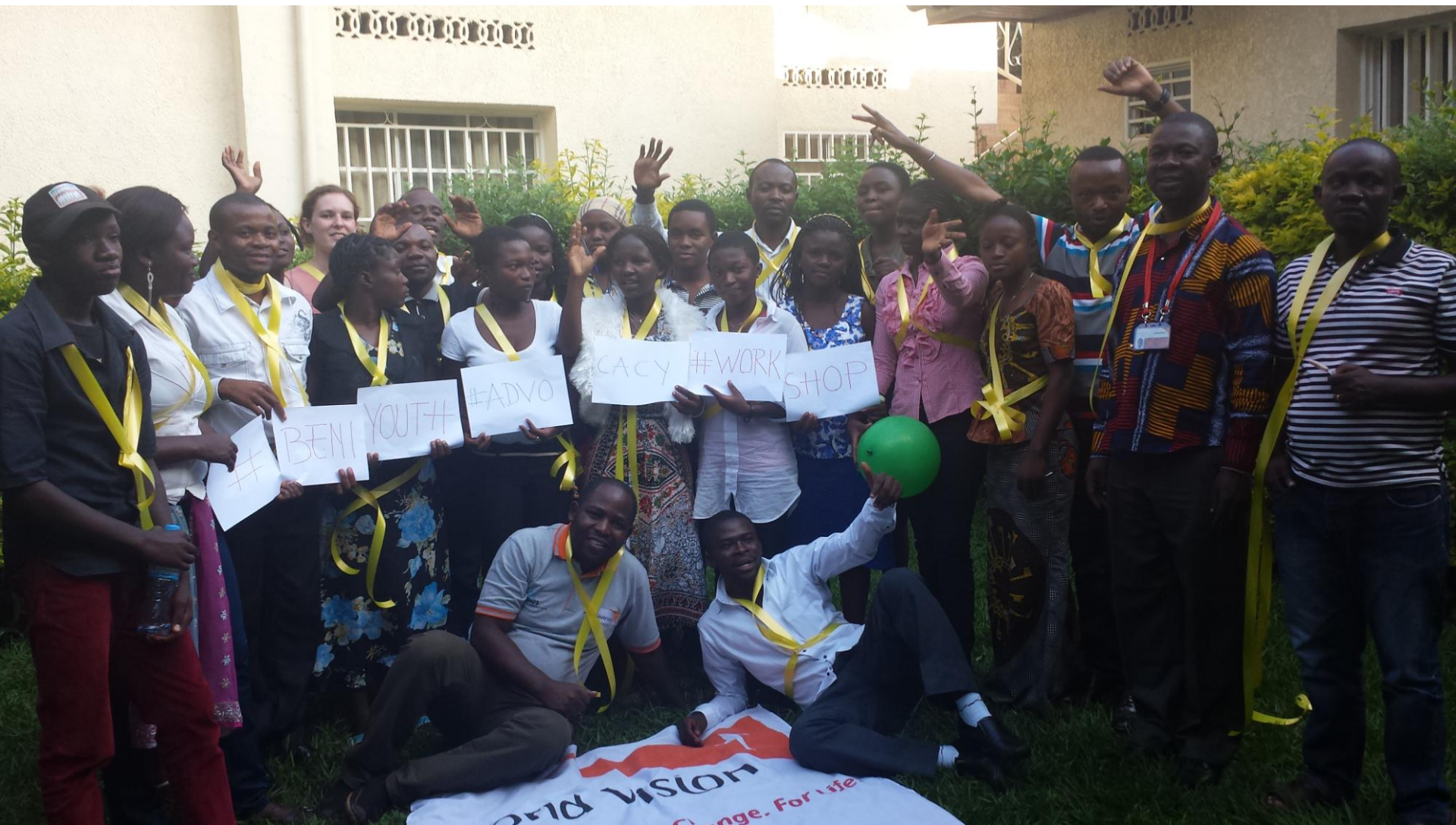
End of workshop celebrations Democratic Republic of Congo 2015.